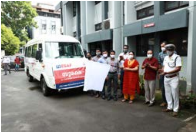
Wayanad District Collector flagging -off the Mobile Vaccination Unit.

The Mobile Vaccination Unit was set up to tackle vaccine hesitancy and accessibility among people groups in specific regions. In geographic terrains where the state machinery is not equipped to host vaccination camps, the mobile vaccination unit brought vaccination to these locations. Tribal people, pregnant women, palliative care patients, persons with physical and mental disabilities were brought under the vaccination cover through the mobile vaccination unit.