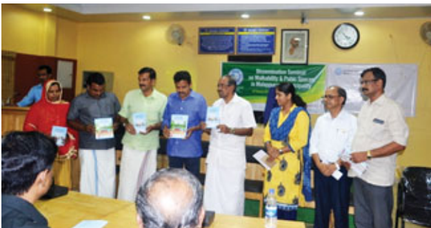
Municipality officials upholding the project report

On 11th Feb 2016, ESAF in association with Malapuram Municipality organized a dissemination seminar of the Walkability Study and Situational Analysis of Parks and Public Spaces which we conducted. It was attended by elected representatives, policy makers, government officials, town planners and social workers. ESAF proposed various measures for improving the pedestrian infrastructure and parks and public spaces. Various renovation activities were initiated in the city as a result of the