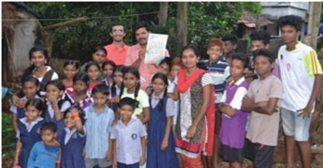
Councilor along with the children upholding the Charter of Demands

The children in Olari CTH submitted a charter of demands to the local ward councilor while he visited the CTH in December 2015. The demands were maintenance of street lights, foot path, availability of playground etc. The councilor and the residents were very happy about the initiative by children and they appreciated the children.