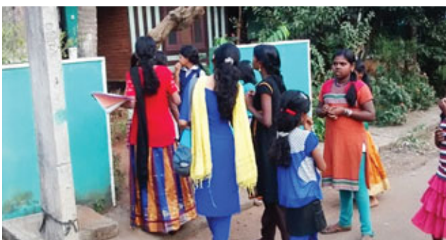
Children doing the mapping procedure at Olari

The children at Olari, Sivaramapuram colony mapped the damaged street lights with the help of the community. This initiative was appreciated by the community members. The map was submitted to the councilor. The initiatives like this shows that children can act as the change makers in the community.