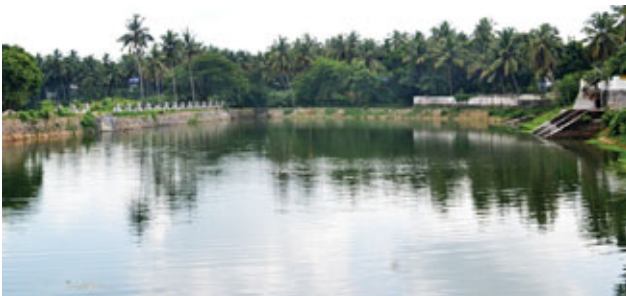
A still of renovated pond

The advocacy efforts of the team has also resulted in a decision