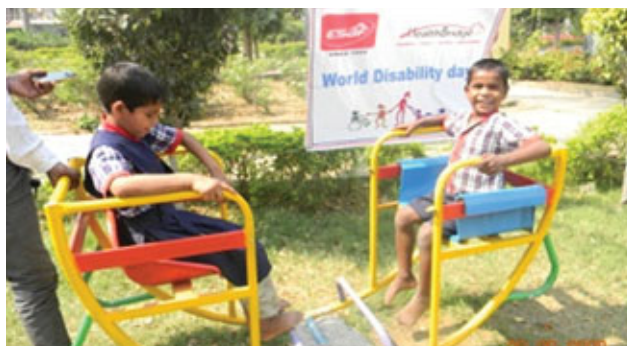
Physically challenged kids playing at the inclusive park

One of our objectives is to transform the city parks into inclusive parks. The series of meetings with the corporates and officials found result when the Nagpur Municipal Corporation approved the proposal we submitted to redesign Adv. Sakharam Pant Mesharam Park as an inclusive park. The renovated park was inaugurated on the International Day of Persons with Disabilities organized by ESAF in the park. The park now benefits all the differently abled children from the schools in that area including the Government School for the Handicapped.