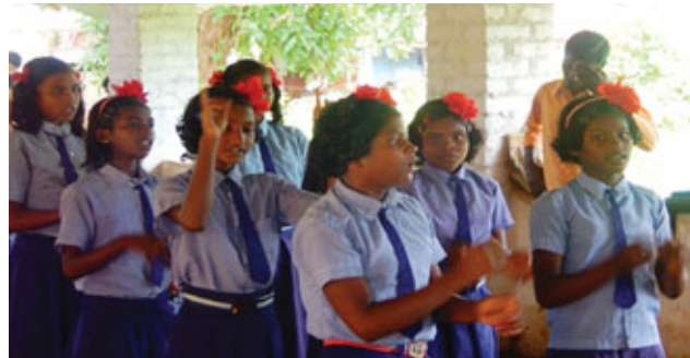
Students of an ESAF Child Care Centre

Through this project ESAF offers educational support to the tribal children in Jharkhand. Tribal young men and women are