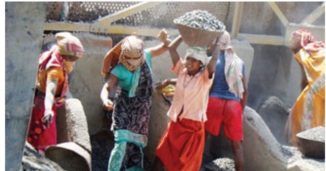
Children working at the stone quarry

The stone quarry project addresses the problems of people living and working in the mining and stone crushing areas in Jharkhand. Many of them have either lost their land or their lands have become useless for cultivation due to dust and pollution. They are left with no other option but to work in these stone quarries and mines. They work in unhealthy situations without any safety measures. Most of them have respiratory tract problem and many contract TB at a young age.