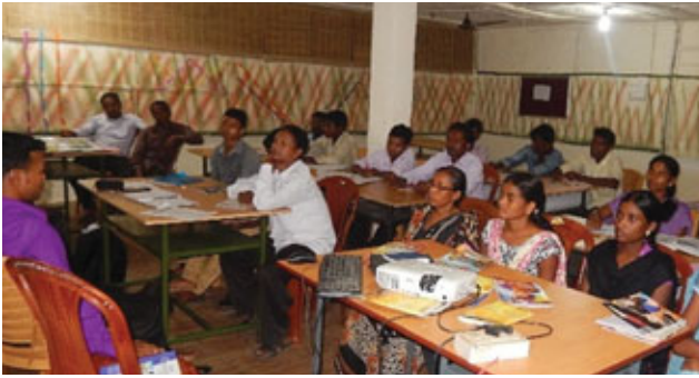
Teachers training is in progress

playing a key role in training the teachers in Spoken English and Personality Development also. As a part of Teachers Capacity building, a one week Annual Teachers Training programme for the child care at FMPB's Leadership Training Institute in ChottaGagri. About 54 teachers and Field coordinators participated in the program. The entire program was filled with information; entertainment and rapport building sessions which helped the Teachers have a good break from their routine activities.