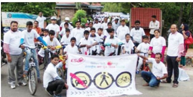
A scene from the cycle rally organized at Gittikhadan

Open street events were organized by Gittikhadan, Rajiv Gandhi Nagar and Nara CTH children in October 2015. More than 200 children participated in the events. The children participated in various events include drawing, painting, tug of war etc. This event helped to communicate the message that roads are meant for people and not just for vehicle.