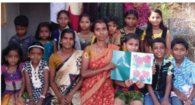
Children upholding magazine

CTH magazine was prepared at different centers for exhibiting the talents of children. Pictures, poems and stories contributed