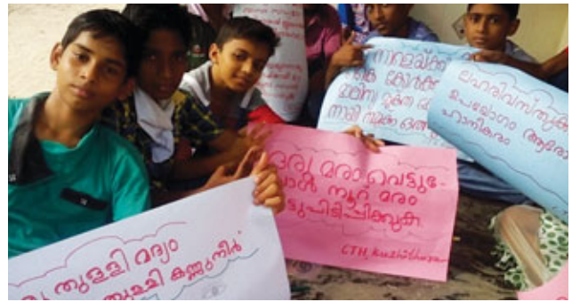
Children upholding placards, posing for a photograph

and Kerala. Many programs and competitions were held. The above photo shows charts prepared by children with messages against drug abuse, deforestation and pollution.