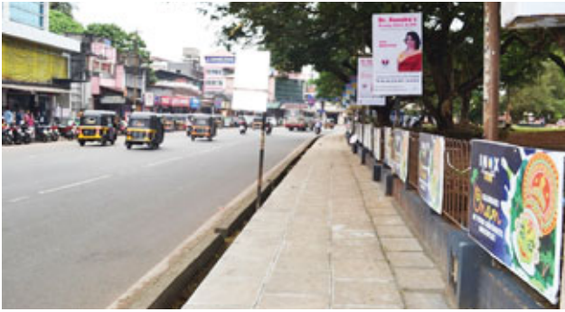
Thrissur Swaraj Round