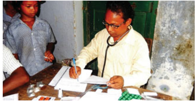
A still from the health camp

Doctors from the Government hospital and from EHA Hospital, Chandra Godda help in conducting the health checkup for the students in Child Care Centers. Students who are diagnosed with serious health problems are referred to the hospital in the