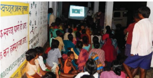
Participants at the programme

The team conducted financial literacy programs for the tribal community with the CSR support of ESAF Microfinance. Videos and Power point Presentations were used to explain savings, National Pension Scheme, opening savings bank account, availing loans etc. It was for the first time many of them were hearing about the importance of having a family budget, saving money for future etc. The Let Them Smile team will fol-