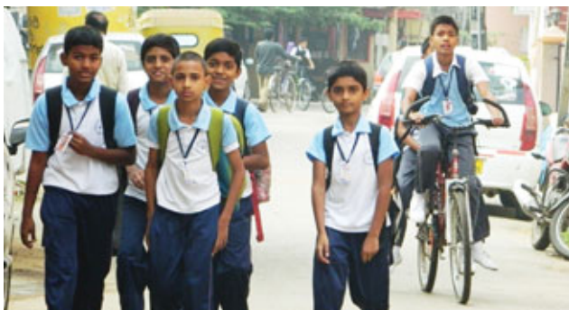
Students going to school by walking and on cycle

'Walk to school on Saturdays' program implemented in the schools in Sanjay Nagar area was very successful. This was implemented in partnership with community organizations and the awareness programs conducted in schools resulted in many students walking or cycling to school on Saturdays. This initia-