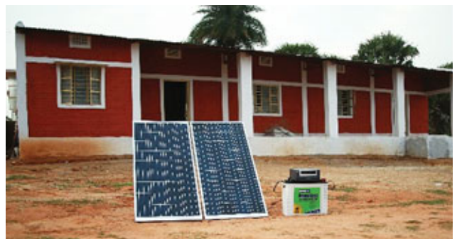
A solar panel fixed at the CCC

As most of tribal villages do not have access to electric power supply, we provide solar lights to students which will help them