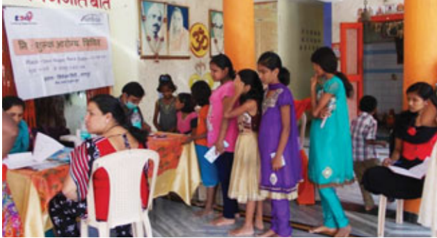
A still from the Medical Camp at Naik Talab CTH

A Dental Checkup Camp was organized at Gittikhadan and Rajiv Gandhi Nagar CTHs. Doctors taught the children about the importance of following healthy brushing habits and distributed brushing kits to children.