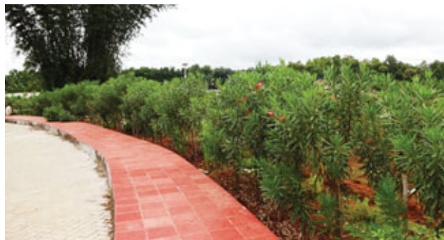
A scene of developed garden

The maintenance works of landscaped area are progressing in Kerala University of Health Sciences. A beautiful garden with varieties of plants and a butterfly garden were developed under this project.