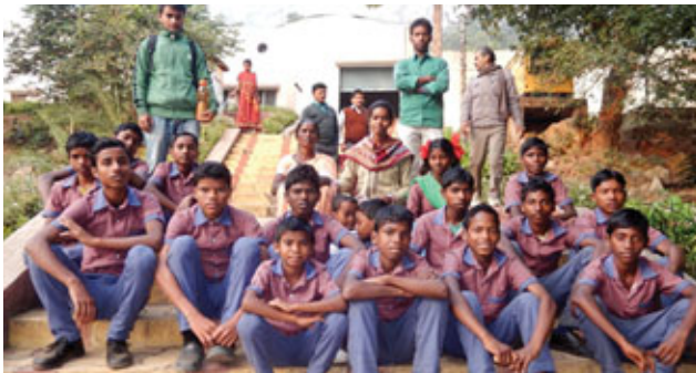
Students of ESAF CCC enjoying the day out

On 11th Dec, the first batch of students in Lahanti Mission School were taken for a tour to TirkutPahar in Deogarh district about 50 Kms away from the school. TrikutaPahar consists of