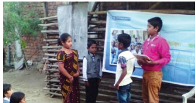
A skit performed by the children at Nagpur