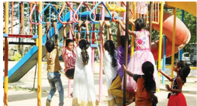
Kids playing at the renovated park at Bangalore

Functional park programs were conducted in two different parks. It has helped to gain momentum for building awareness among the community about the need and importance of public spaces. A park visit for the children in the community was arranged so that they could get a feel of what they are missing out