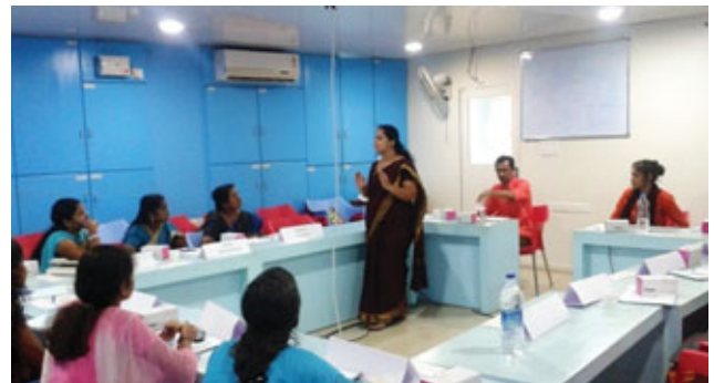
Participants along with resource persons