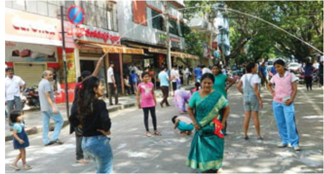
A still from the open street event at Bangalore

(Bangalore Coalition for Open Streets) and DULT (Directorate of Urban Land Transport). ESAF was successful in building the capacity of nine community partners for organizing cycle days. Government bodies have increased reach in neighborhoods of Bangalore urban district through Cycle day events.