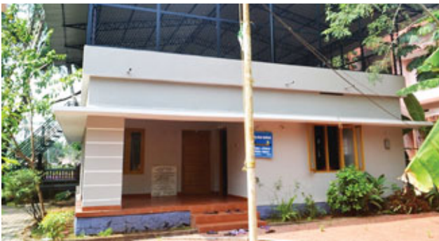
Renovate cultural village at Ollukkara

ESAF Livable Cities team's consistent advocacy efforts found results when Thrissur Municipal Corporation allocated Rs.21 lakhs for renovation works of Children's Cultural Village, Ollu-