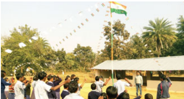
National Flag hoisting on Independence Day

Republic Day, Independence Day and Christmas celebrations were organized at all centers. This year the students and teachers in Baramasiya Child Care Centre decided to celebrate Republic day in a unique way. They went around and collected all the waste in the village and disposed it. Though unaware of the