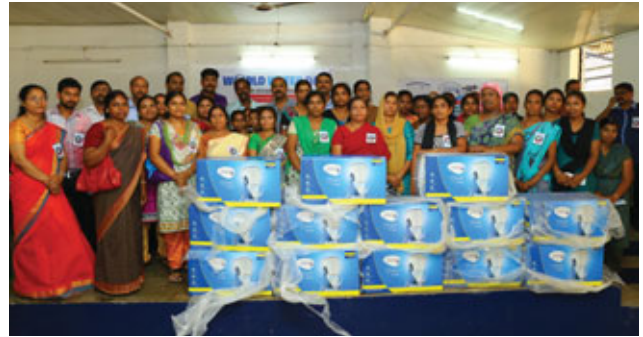
Beneficiaries of Water Purifiers posing for a photo at the WED programe at Mala

The World Water Day is focused to address the burning issue of 750 million people of world population who has not access to safe water. World water Day was organized in different branch-