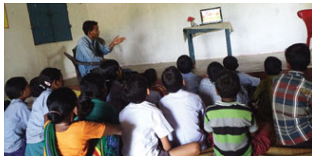
Students learning with the help of laptop computer

Laptops are provided to our field staff through which schools with classes above 3rd grade are given the opportunity to gain knowledge on computers. Another step to improve the qual-