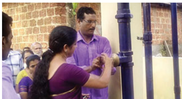
Inauguration of Jalanidhi scheme at Valiyavelichaparambu, Kuttiattoor

ESAF with support of Kerala government and World Bank are implementing 16 micro drinking water schemes in Kuttiyattoor panchayath of Kannur. 10 of them have been already commissioned and the six are in the completion phase. The project is