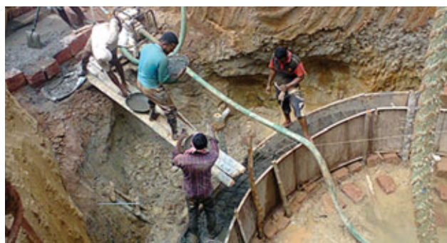
Construction of community well in progress

designed to provide clean & safe drinking water to 1500 homes. Ground water recharging, pay & use and public toilets, new toilets for 187 houses were also completed under this project.