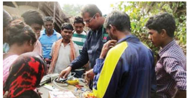
Village visit in progress

Promotional meetings were conducted in all the places where there was a need for alternative livelihood. In all the places there was good participation from the community. Explanation was given to the people regarding the training and the benefits of the livelihood training.