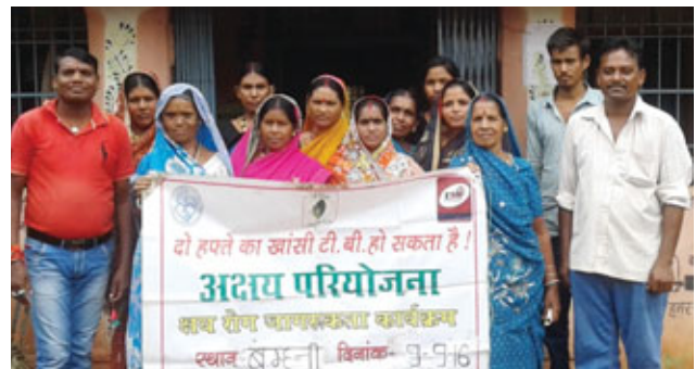
Project team along with the patients undergoing treatment

This campaign aimed at bringing awareness on the preventive and curative aspects of TB is implemented in Mahasamund district of Chattisgarh in partnership with Emmanuel Hospital Association. ESAF volunteers identify TB patients and get them enrolled in Axshya project where they get access to quality TB care. More than 100 patients who were referred by ESAF team for treatment are on the road to full recovery.