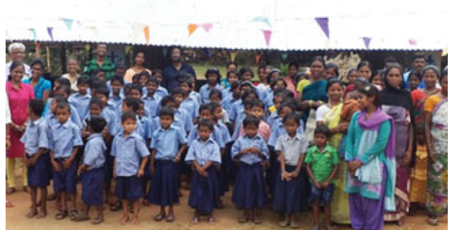
Students posing for a photo in front of the renovated CCC

Chapathari, Ladhpathar and Hinjor centers were re-roofed with aluminum sheets provided through the ESAF Microfinance CSR program. The inaugural functions were held on 15th