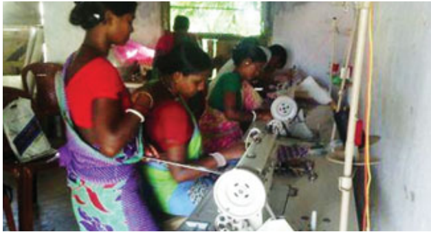
A still from the jute bag training programme

were given to the communities. People showed interest in the training and plans for marketing the products were also made.