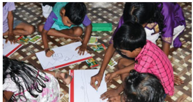
A still from the painting competition

Painting competition on the theme 'Your dream city' was conducted in November 2015. Prizes were distributed for the winners. The competition was aimed at bringing out the creative abilities of children and helping them to dream about their city and environment. Most of the children focused on the importance planting trees and reducing the use of motor vehicles.